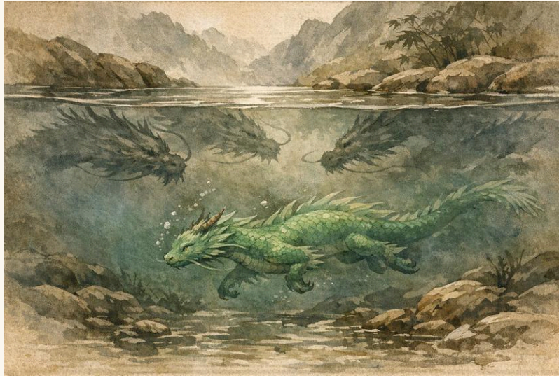
PANEL 3 · HARD PART