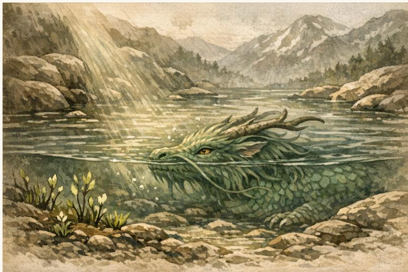
PANEL 2 · FIRST SIGN

ORACLE LENS The condition before the change becomes visible. Notice the ground you are starting from.