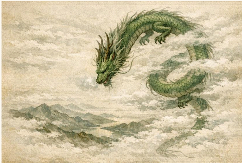
PANEL 4 · TURNING RESPONSE

ORACLE LENS The pressure point. This is where patience, honesty, restraint, or courage is tested.