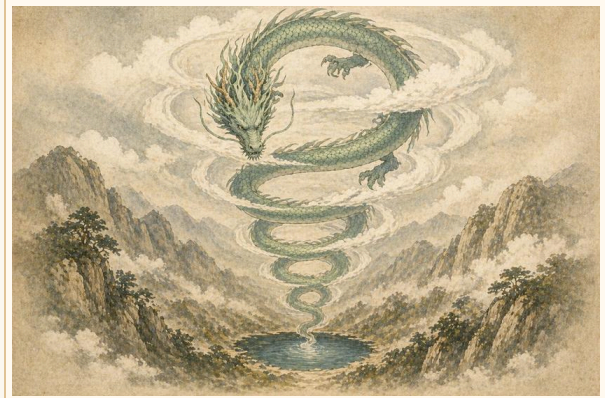
Remembering The Pool