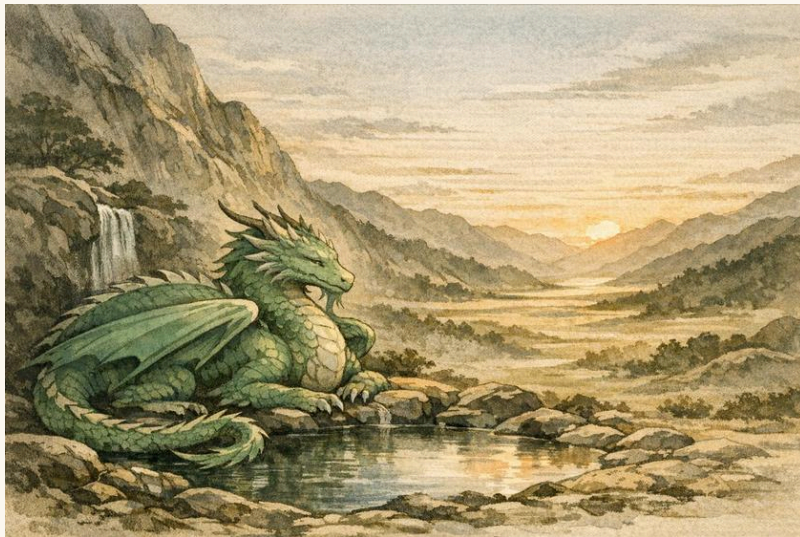
PANEL 6 · LESSON PICTURE

ORACLE LENS The consequence. The choice begins to show its result.